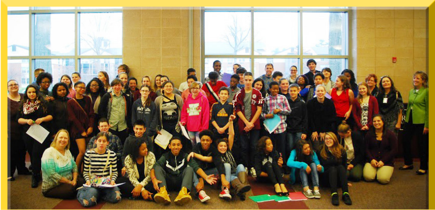
Middle school students meet their college mentors at Rider University, before enjoying a complimentary lunch and tour of the campus.