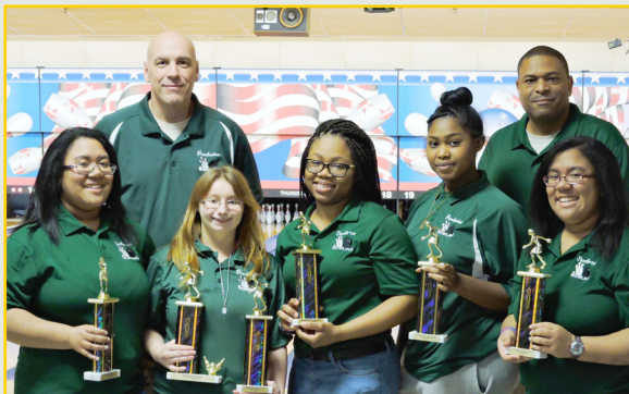
BCSL Girls Bowling Tournament Champs!

▲ The Hornet Boys Basketball Team won the first Sectional Title in school history, becoming the 2016 Central Jersey Group 3 Champions!