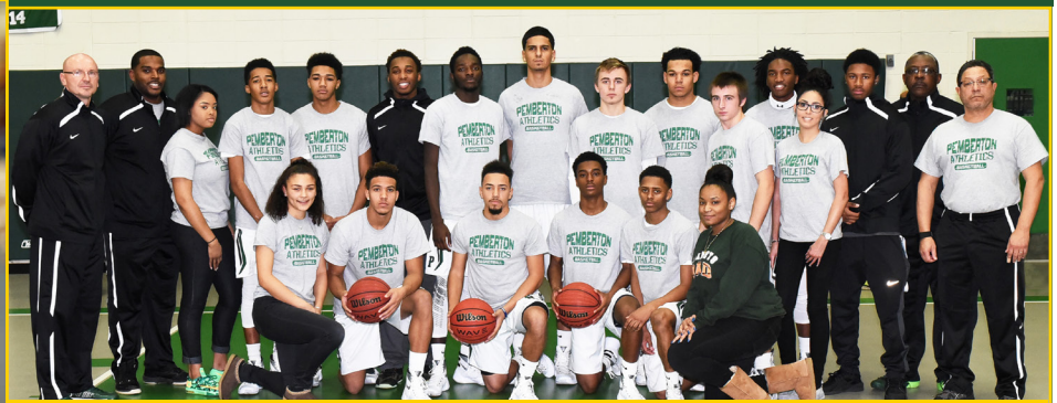
Boys Basketball: 2016 Central Group 3 CHAMPIONS!

The PTHS Girls Bowling ► Team won the 2016 BCSL (Burlington County Scholastic League) Divisional Tournament.