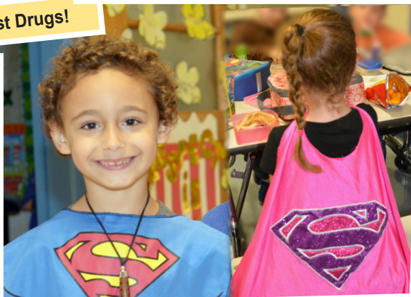
Displaying Super Character Traits