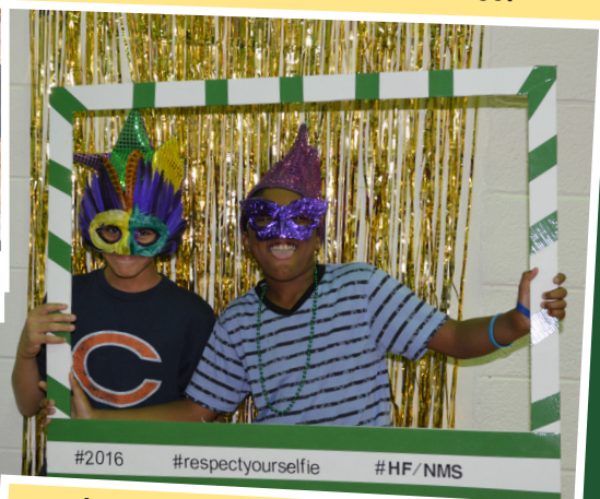
Learning to Respect Your Selfie!