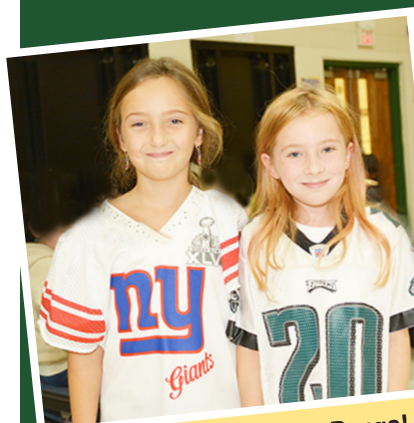
Teaming Up Against Drugs!