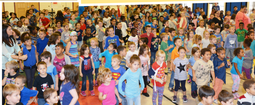
Joining in the Flash Mob Character Dance!