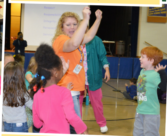
Doing the R-E-S-P-E-C-T Dance!