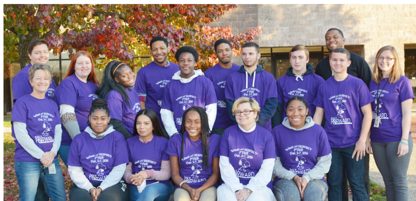
Students Honored for Successfully "Paying it Forward"