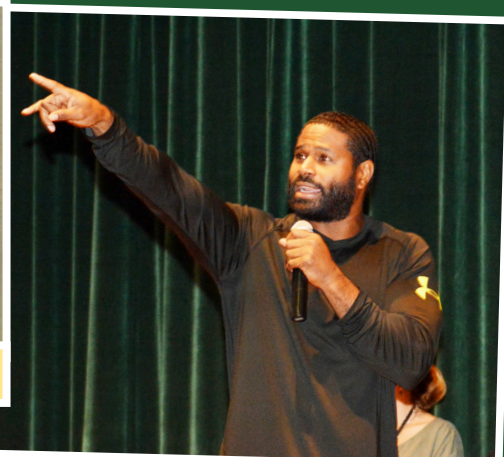
Guest Speaker Inspires Teens