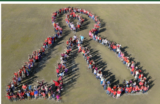
Staff & Students Form Life-Size Red Ribbon!