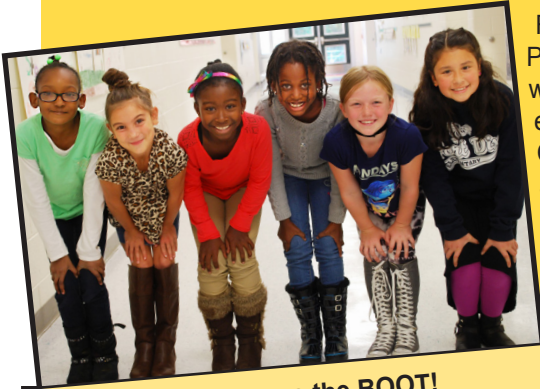
Giving Drugs the BOOT!