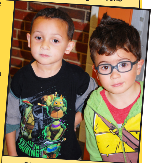
Displaying Our Character!