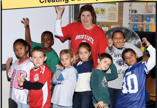
Teaming up Against Violence

From preschool to high school, Pemberton students joined in state-wide recognition weeks to put an end to bullying, violence and drugs. Coordinated by building counselors and administrators, the weeks featured scores of activities ranging from poetry contests to guest speakers to drug-free pledges and more.