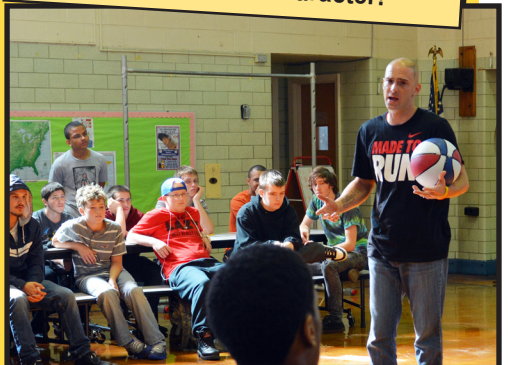
Inspirational Guest Speakers