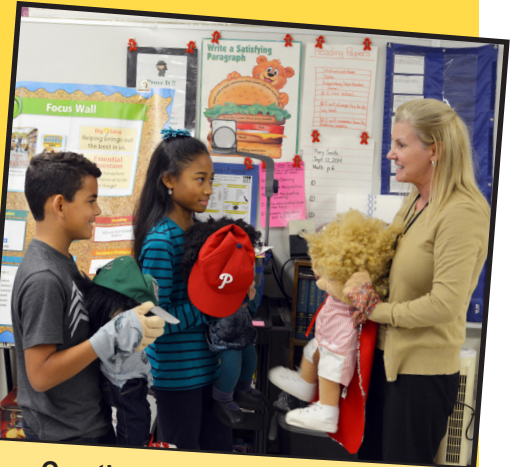
Creative Anti-Bullying Lessons