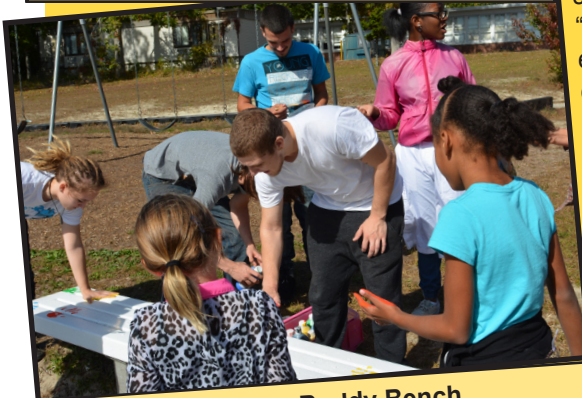
Creating a Buddy Bench