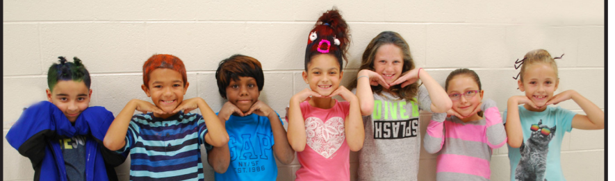
Doing our Hair, Not Drugs!