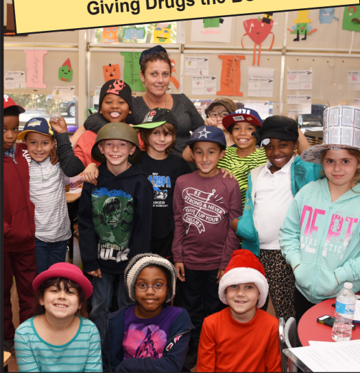
Putting a Cap on Drugs!