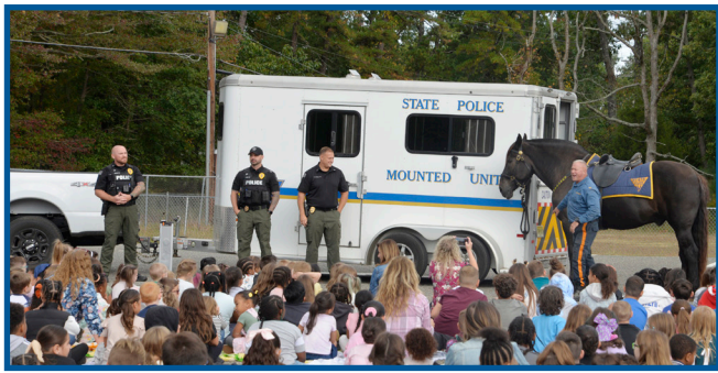
Students at Denbo-Crichton Elementary School observe a Mounted Unit presentation by a member of the New Jersey State Police with assistance from the Pemberton Township Police Department.

The New Jersey State Police's Aviation Unit visited Denbo-Crichton on Thursday, October 24th. Officers