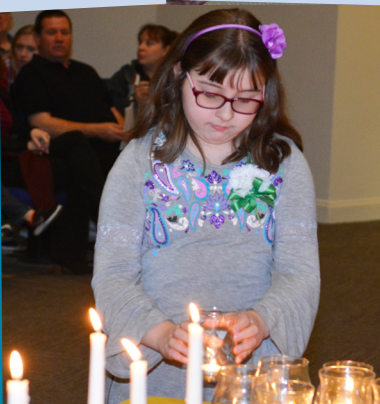
National Elementary Honor Society Induction