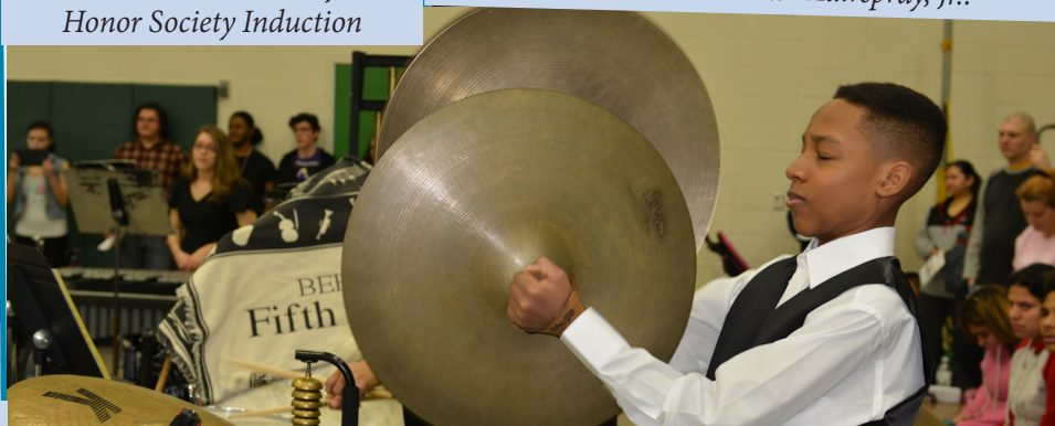
District Instrumental and Fine Arts Festival