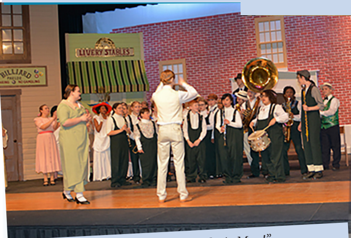
PTHS Musical: "The Music Man!"