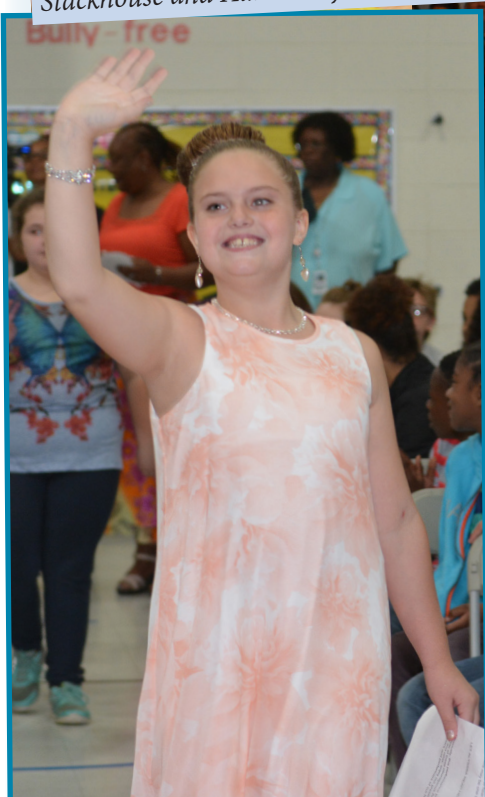
Busansky Drama Club Presentation