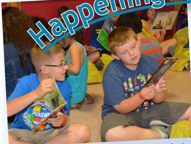
Stackhouse and Harker-Wylie Free Books Distribution