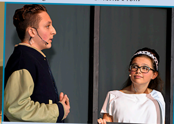
Middle School Musical: "Hairspray, Jr.!"