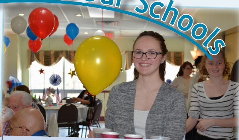
PTHS students serving at the Senior Citizens Prom