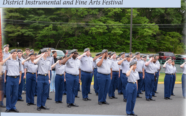
PTHS Memorial Day Ceremony